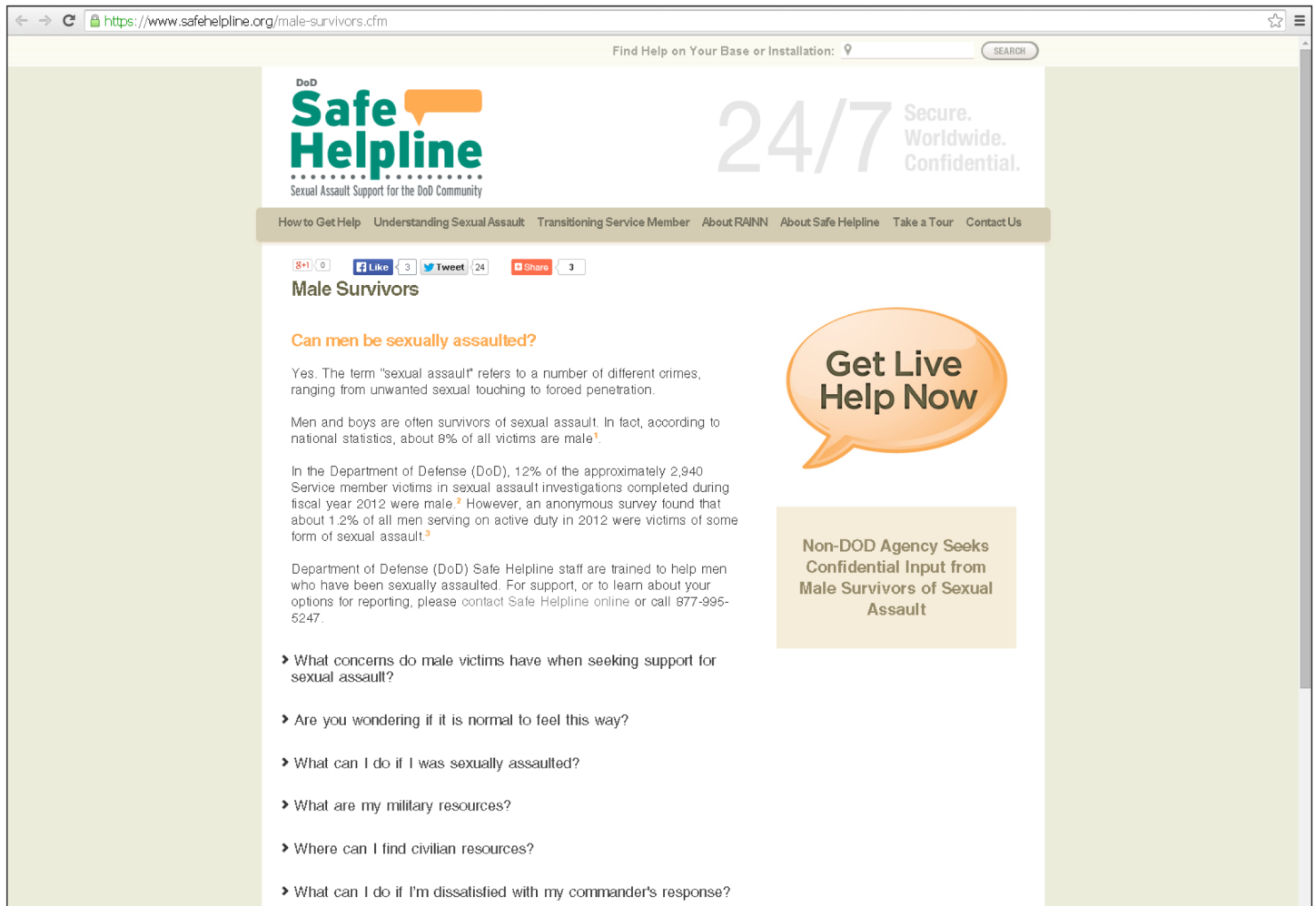
Figure 2: Safe Helpline Male Survivors Page

Source: Department of Defense (DOD). | GAO-15-284