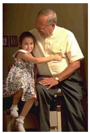
VA programs provide $1.1 trillion insurance coverage.

VA directly administers six life insurance programs and supervises the Servicemembers' Group Life Insurance and the Veterans' Group Life Insurance programs. These programs provide $1.1 trillion in insurance coverage to 4.5 million veterans, active-duty servicemembers, reservists and Guardsmen, plus 3 million spouses and children.