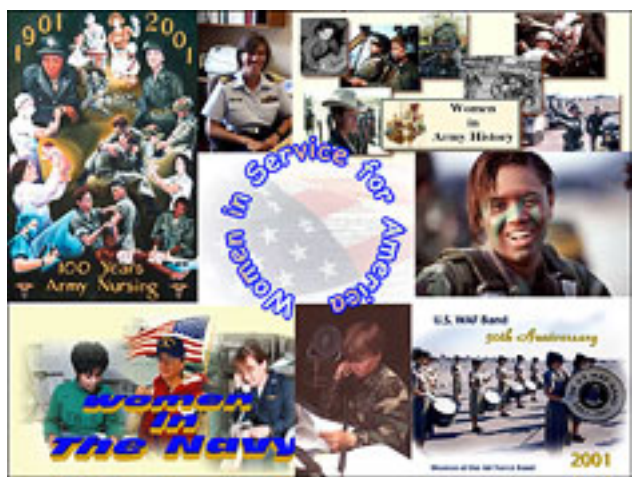
VA's Center for Women Veterans

In response to the growth in the number of women veterans, VA has expanded medical facilities and services for women and increased efforts to inform them that they are equally entitled to veterans benefits. The Veterans Health Care Act of 1992 provided authority for a Variety of gender-specific services and programs to care for women veterans.