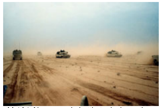
M-1A1 Abrams main battle tanks in northern Kuwait during Operation Desert Storm.

The legislation extended to Persian Gulf War veterans eligibility for wartime-only pensions, medical treatment, educational benefits, housing loans and unemployment payments.