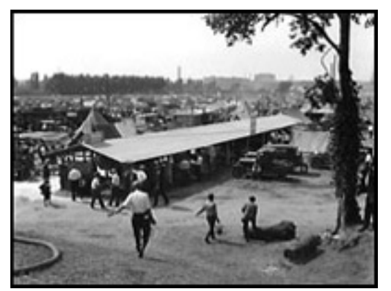
Bonus Marchers' Encampment

Health officials grew concerned about the threat of disease. In response, the newly created Veterans Administration established an emergency hospital on a War Department reservation at Fort Hunt, Va., on June 11, 1932. The hospital treated 282 veterans that summer, many for diarrhea, dysentery and influenza.