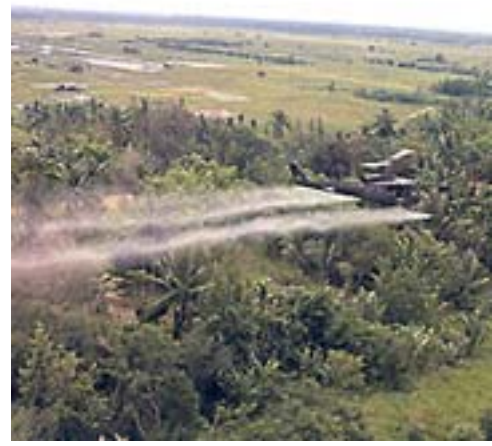
The herbicide Agent Orange was used extensively to defoliate trees and remove cover for the enemy.

The VA in 1981 established a special eligibility program which provides free follow-on hospital care to Vietnam veterans with any health problems whose cause is unclear.