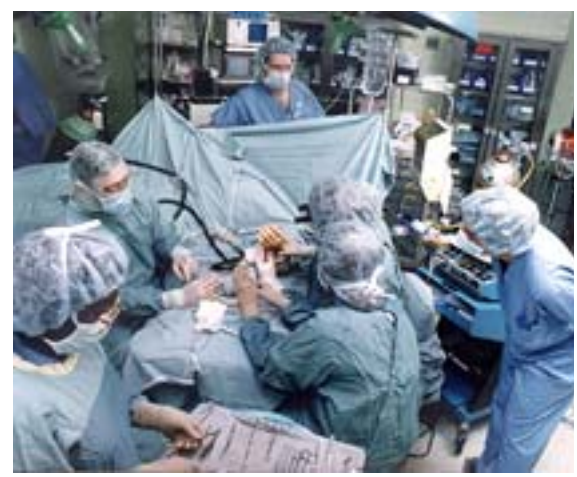
More than 5.3 million people received care in VA health care facilities in 2005.

VA operates more than 1,300 sites of care including nearly 900 ambulatory care and community-based outpatient clinics, 136 nursing homes, 43 residential rehabilitation treatment programs, nearly 90 comprehensive home-care programs, and more than 200 Veterans Centers