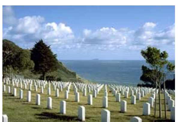
Fort Rosecrans National Cemetery, San Diego, Calif.

In 2005, VA national cemeteries conducted more than 93,000 interments, provided nearly 364,000 headstones or markers for veterans' graves and approximately 488,000 Presidential Memorial Certificates to veteran's next of kin and loved ones to commemorate honorably discharged, deceased veterans. Since 1973, the department has provided more than 9.2 million headstones and markers. Additionally, VA has awarded more than $258 million for the development, expansion or improvement of 63 state