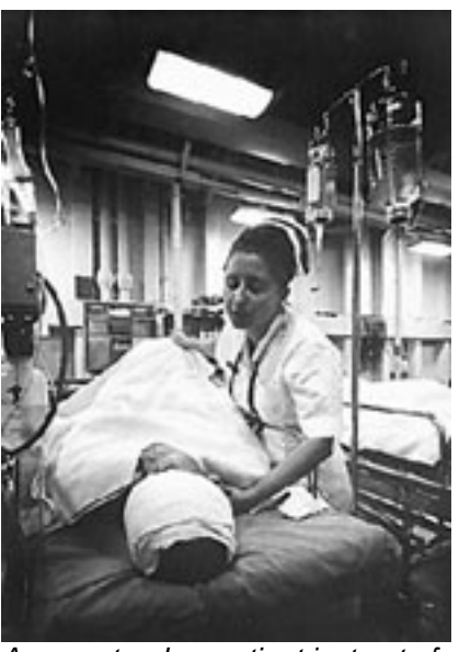
A nurse tends a patient just out of surgery in the intensive care ward of the hospital ship USS Repose (AH-16) off the coast of Vietnam.

Advances in airlift and medical treatment meant that many wounded and injured personnel survived who would have died in earlier wars. By 1972 there were 308,000 veterans with disabilities connected to military service.