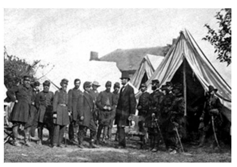
President Lincoln at the Antietam battlefield, October 1862

When the Civil War broke out in 1861, the nation had about 80,000 war veterans. By the end of the war in 1865, another 1.9 million veterans had been added to the rolls. This included only veterans of Union forces. Confederate soldiers received no federal veterans benefits until 1958, when Congress pardoned Confederate servicemembers and extended benefits to the single remaining survivor.