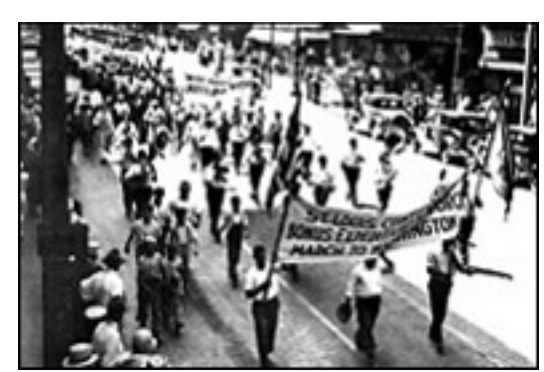
World War I Bonus Marchers

As the Depression worsened, veterans began calling for immediate payment of their "bonuses," as the certificates came to be called. In March 1932, a small group of veterans from Oregon began marching to Washington, D.C., to demand payment. Word of the march spread like wildfire and soon small bands of unemployed veterans from across the country began descending on the nation's capital.