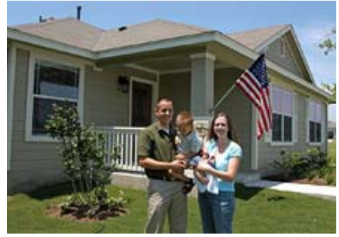
In fiscal year 2005, VA guaranteed 165,854 loans valued at $25 billion.

From 1944 — when VA began helping veterans purchase homes under the original GI Bill — through May 2006, VA issued more than 18 million VA home loan guarantees, with a total value of $892 billion. In fiscal year 2005 alone, VA guaranteed 165,854 loans valued at $25 billion and, at the beginning of fiscal year 2006, had 2.3 million active home loans reflecting amortized loans totaling $202.1 billion. VA's specially adapted housing programs helped about 587 disabled veterans with grants totaling more than $26 million in 2005.