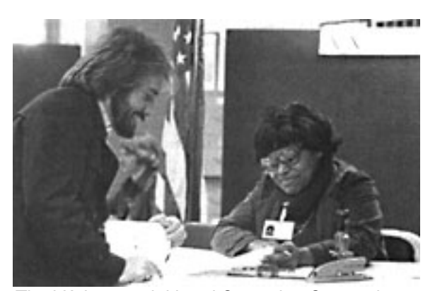
The VA in 1968 initiated Operation Outreach to make veterans more aware of their benefits.

To assist all Vietnam-era veterans, the VA adopted new outreach measures to bring benefits to their attention. Veterans assistance centers were established in 21 cities to help recently separated servicemembers. VA representatives in 1967 were assigned to duty at Long Binh, Vietnam, to assist servicemembers before they were discharged. The VA in 1967 also installed toll-free telephone service to regional offices in each state.