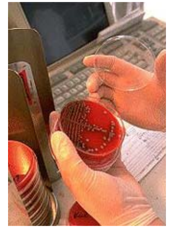
In 2005, VA supported approximately 3,800 researchers at 115 VA medical centers.

pressure. The "Seattle Foot" developed in VA allows people with amputations to run and jump.