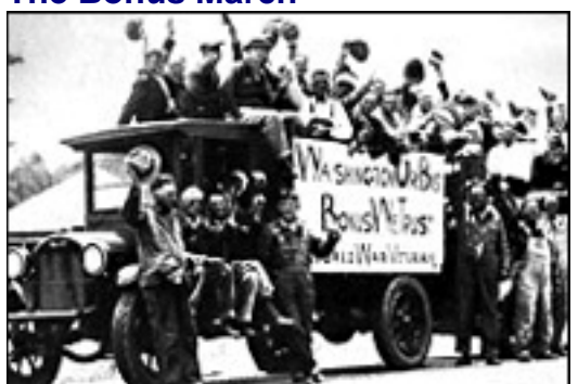
World War I Veterans Descend on Washington, DC

The Great Depression was merciless. The loss of jobs, life savings and confidence left many unable to make a living. Trapped in its wake, World War I veterans suffered tremendous pressure during the economic slump. After returning from the Great War, many faced destitution and did all they could to survive.