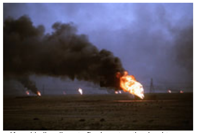
Kuwaiti oil wells set afire by retreating Iraqi troops following Operation Desert Storm.

Gulf War veterans, even before the hostilities ended, began complaining of symptoms with no readily identifiable cause. The symptoms included fatigue, skin rash, headache, muscle and joint pain, memory loss and difficulty concentrating, shortness of breath, sleep problems, gastrointestinal problems and chest pain.