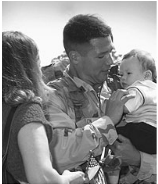
Combat veterans are eligible for VA health care for two years after leaving the service.

Since 1998, veterans who served in a combat zone or in comparable hostilities have been eligible for free VA hospital care, outpatient services and nursing home care for two years after leaving active duty for illnesses and injuries that may be the result of their military service. In 2000, VA established the Benefits Delivery at Discharge program at military discharge sites to assist service members separating from the military.