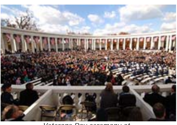
Veterans Day ceremony at Arlington National Cemetery

Of the 24.3 million veterans alive at the start of 2006, nearly three-quarters served during a war or an official period of conflict. About a quarter of the nation's population, approximately 63 million people, are potentially eligible for VA benefits and services because they are veterans, family members or survivors of veterans. VA's fiscal year 2005 spending was $71.2 billion, including $31.5 billion for health care, $37.1 billion for benefits, and $148 million for the national cemetery system.