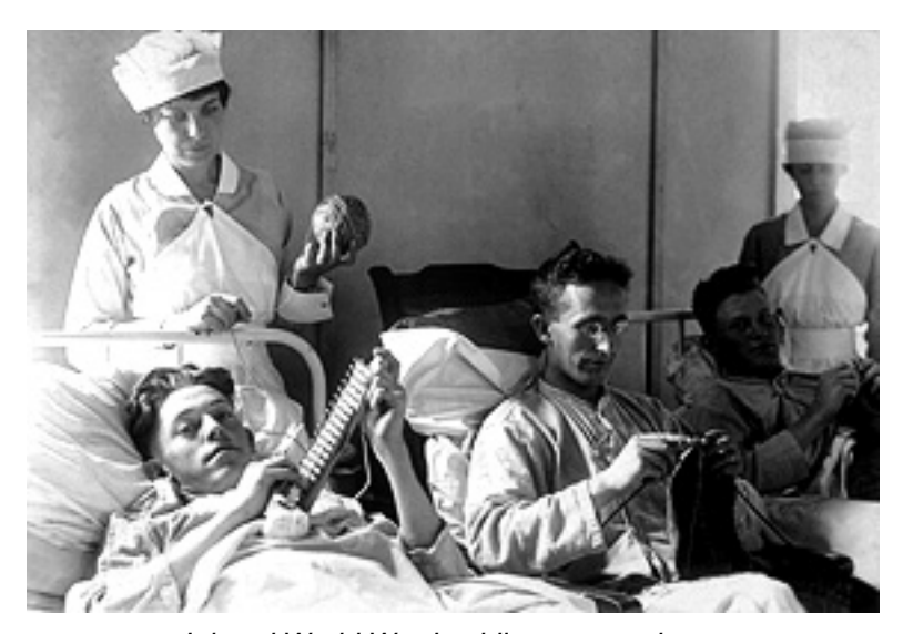
Injured World War I soldiers recovering at Walter Reed Army Medical Center, Washington, DC

The War Risk law was amended in mid-1917 to provide insurance against loss of life, personal injury or capture by the enemy of personnel on board American merchant ships. The amended law also offered government-subsidized life insurance for veterans. Other legislation provided for a discharge allowance of $60 at the end of the war.