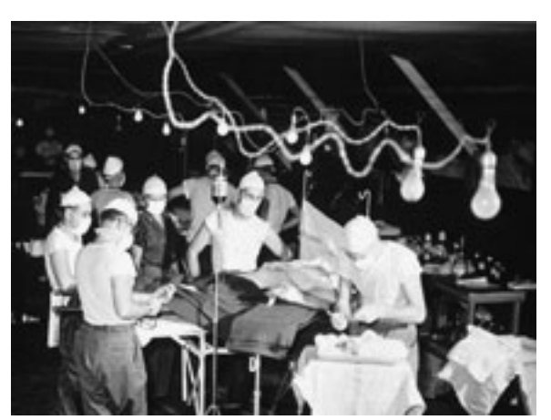
8209th Mobile Army Surgical Hospital (M.A.S.H.) Korea, August 1952

In contrast to the 48 months of education allowed by the 1944 law, the Korean GI Bill permitted a maximum of 36 months. The Korean GI Bill also did not provide tuition payments to the colleges. Instead, veterans were paid subsistence checks, which were also to cover their college expenses. The effect of the changes was that the benefit no longer completely covered the cost of the veteran's education.