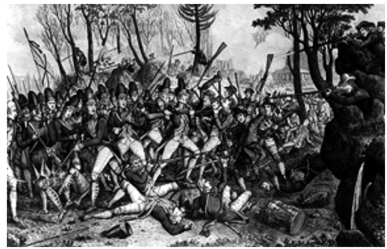
Battle of Lexington, April 19, 1779

From the beginning, the English colonies in North America provided pensions for disabled veterans. The first law in the colonies on pensions, enacted in 1636 by Plymouth, provided money to those disabled in the colony's defense against Indians. Other colonies followed Plymouth's example.